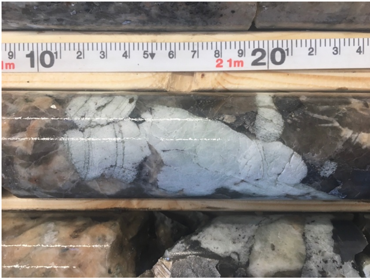
Photo 2.0 - Coarse grained spodumene for GRMT-003