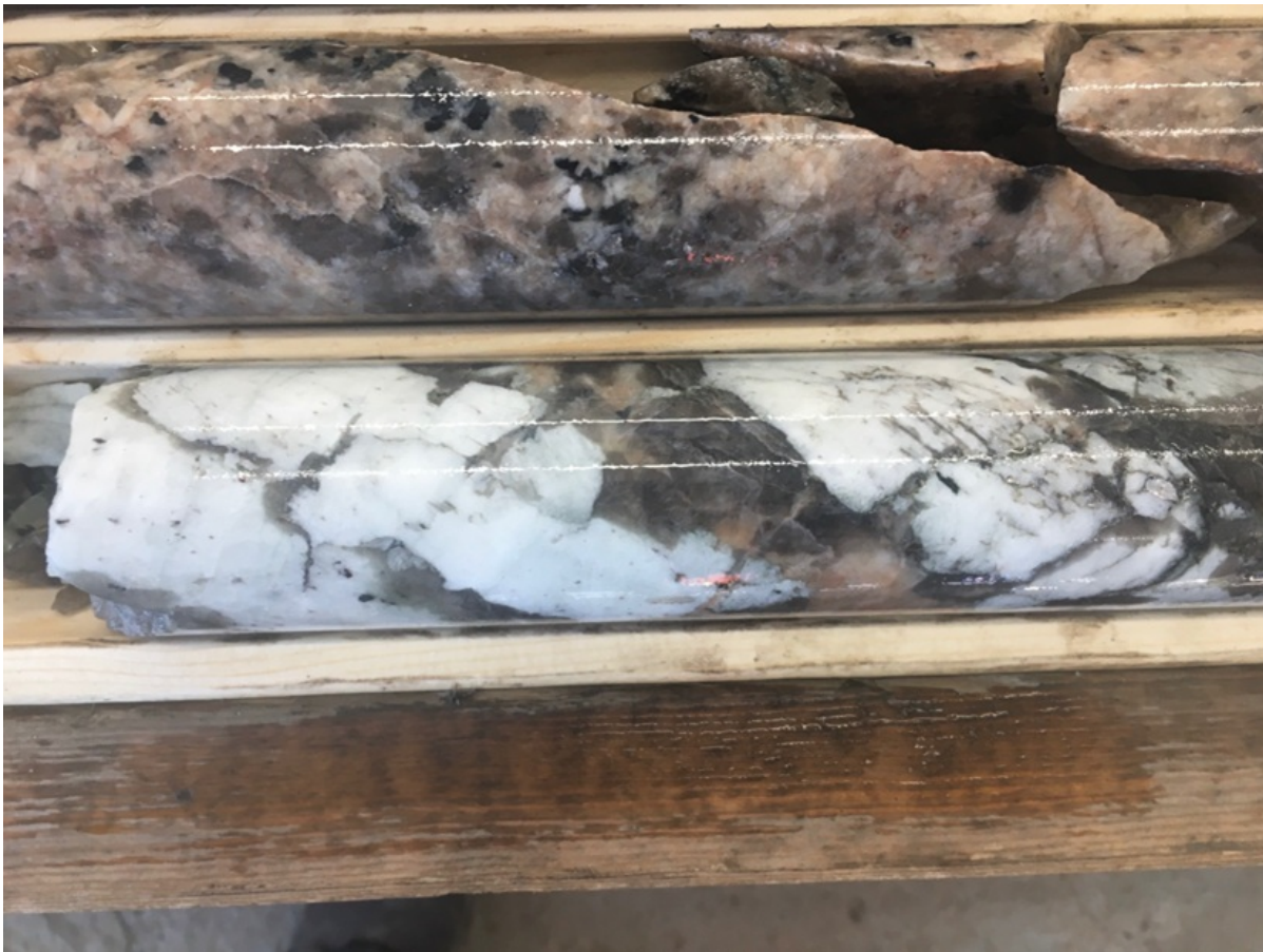
Photo 3.0 - Coarse grained spodumene for GRMT-003