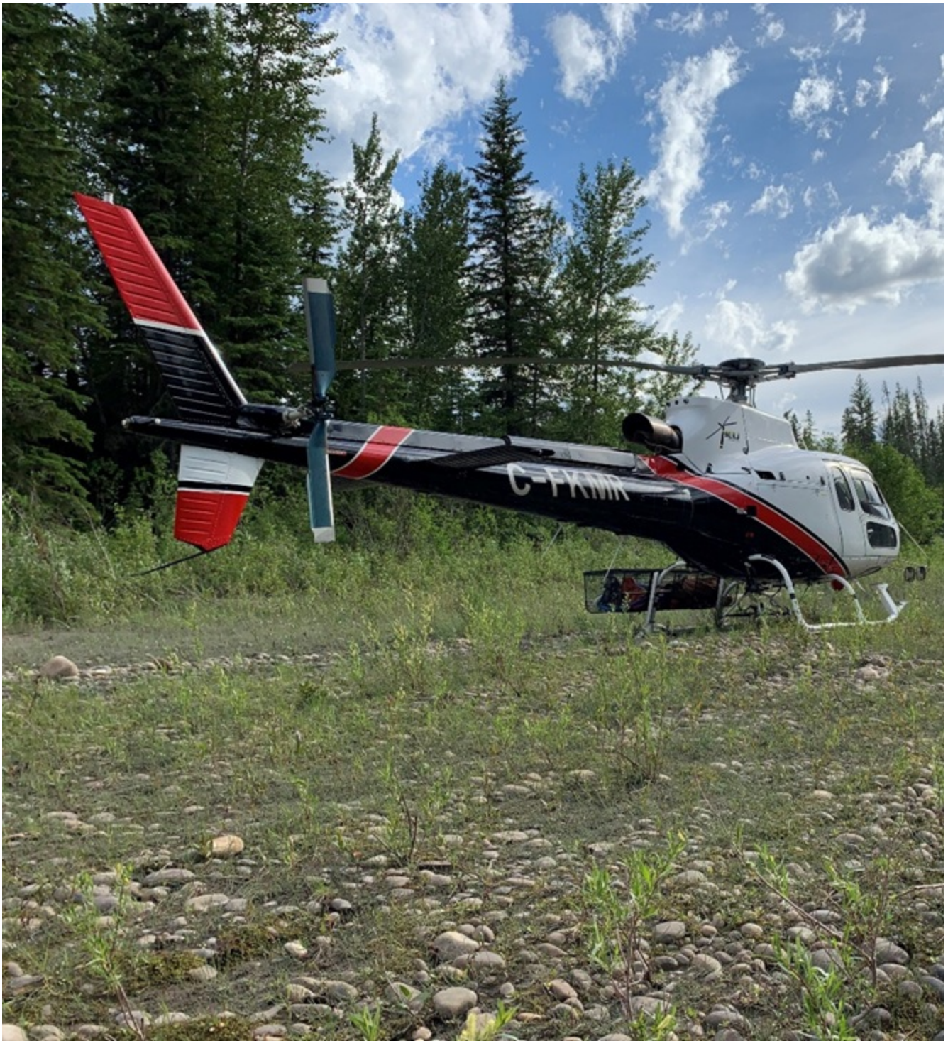
Image 1 - Heli Source Ltd. Helicopter

Concurrently, Snow Lake continues to progress the environmental, engineering and feasibility programs in order to achieve the necessary milestones for commercial production.