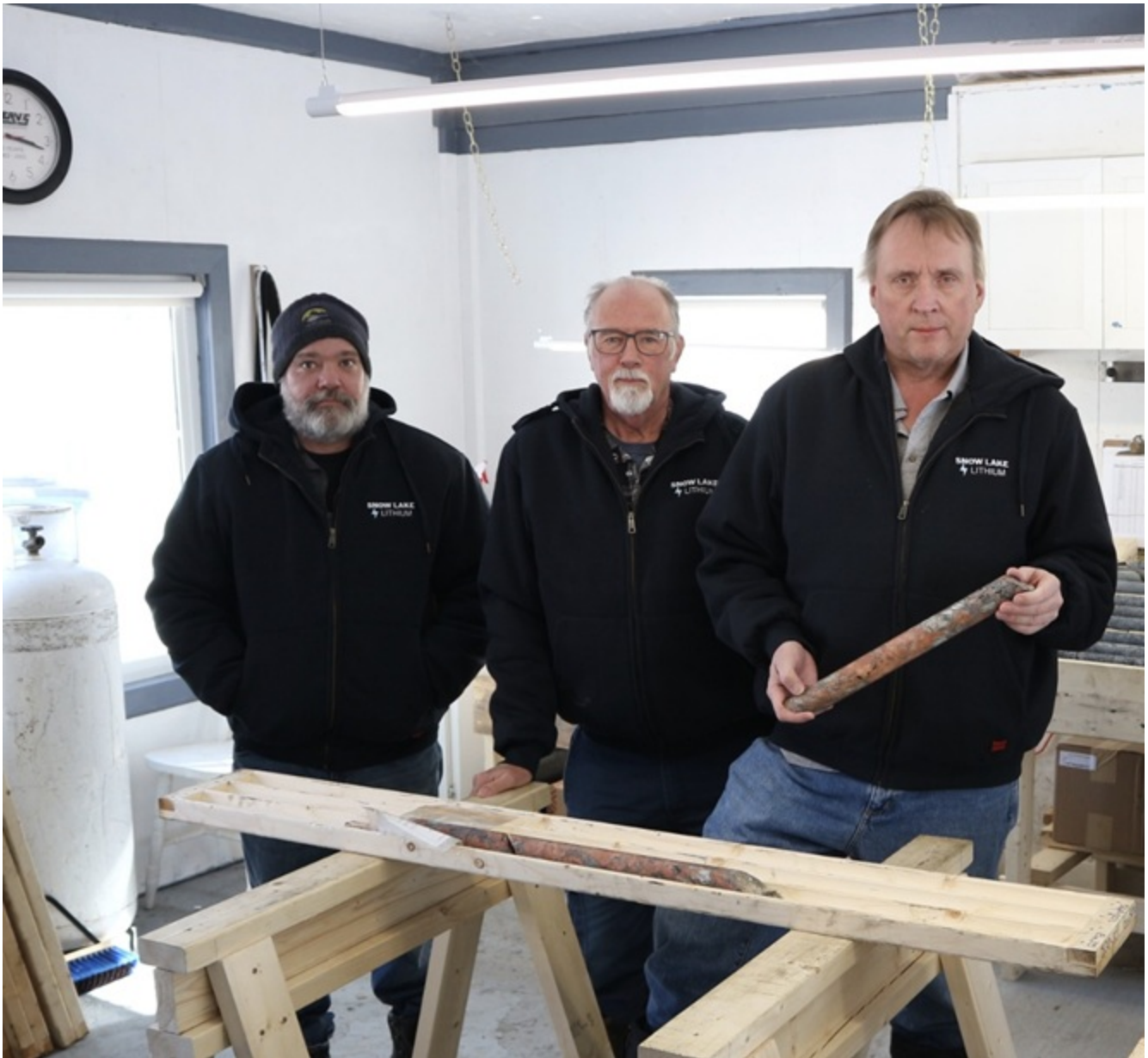
Image 2 - Snow Lake Team Holding Drill Core From Current Drilling