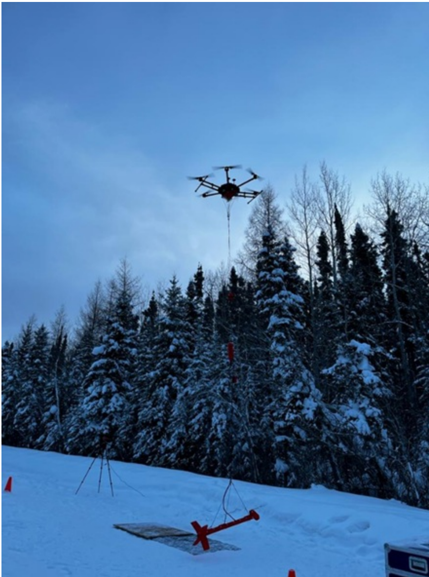
Photo 1 - Drone taking flight during survey over SG dyke

In addition to the known pegmatites, the EarthEx survey has revealed several other magnetically low lineaments with favorable structural orientations in the vicinity near the SG and GR dykes. The survey will continue over the Thompson Brothers Lithium deposit area this week.