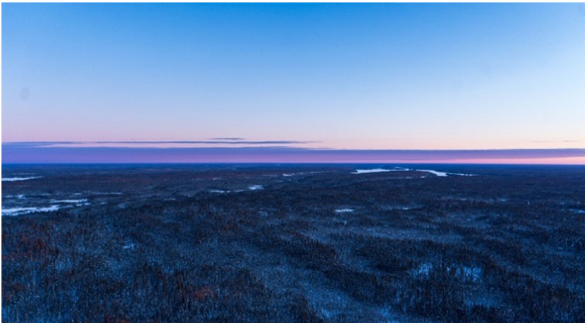
Picture 1 - Snow Lake's project is nearly four times the size of Manhattan

WINNIPEG, MB / ACCESSWIRE / February 8, 2022 /Snow Lake Resources Ltd., d/b/a Snow Lake Lithium Ltd. (NASDAQ:LITM) ("Snow Lake" or the "Company"), would like to advise the market of it's recent acquisition and substantial property expansion in and around it's current resource block at the Thompson Brothers Lithium Project in Manitoba, Canada. The Company, with the assistance of an external consultant, has been engaged over the past several years in historic geological data analysis, diligence and in depth "in-the-field" prospecting campaigns. The resulting efforts have culminated in the acquisition, through the staking and filing of claims with the Manitoba Mineral Resources Division, of mineral rights on an additional 33,614 acres (13,603 ha) of Crown land which we believe is highly prospective of lithium. The total land holdings for Snow Lake Lithium now stands at 55,318 acres (22,386 ha) or 86.43 square miles.